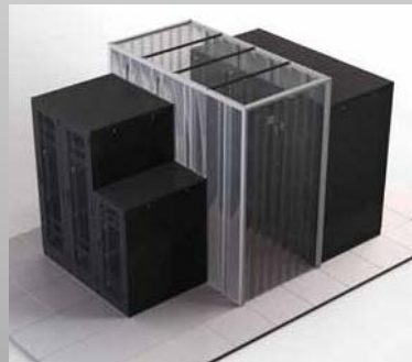
Modular contained aisle