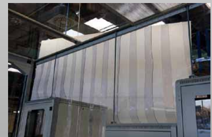
Modular Contained aisle with different Cabinet heights

The products are manufactured in Europe and compliant to ISO 9001 and ISO 14001 standards