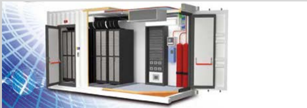
Functional Data Center