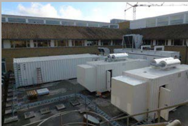
Data Center container outdoors