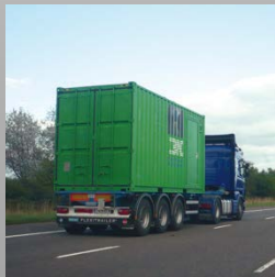
DC rapid deployment