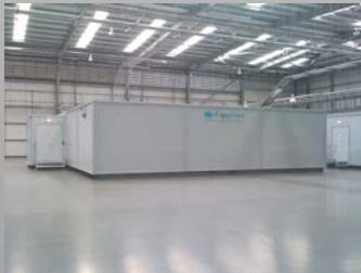
Data Center Container In a warehouse