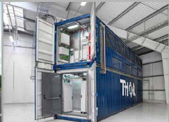
the lower container is IT equipment